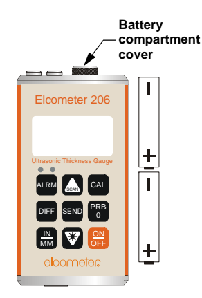
Figure 2. Fitting batteries

Do not dispose of any batteries in fire.